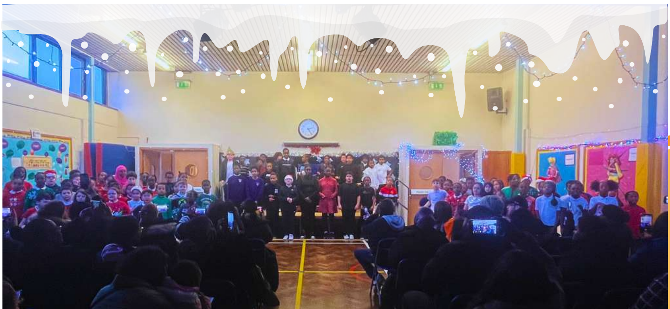
KEY STAGE 2