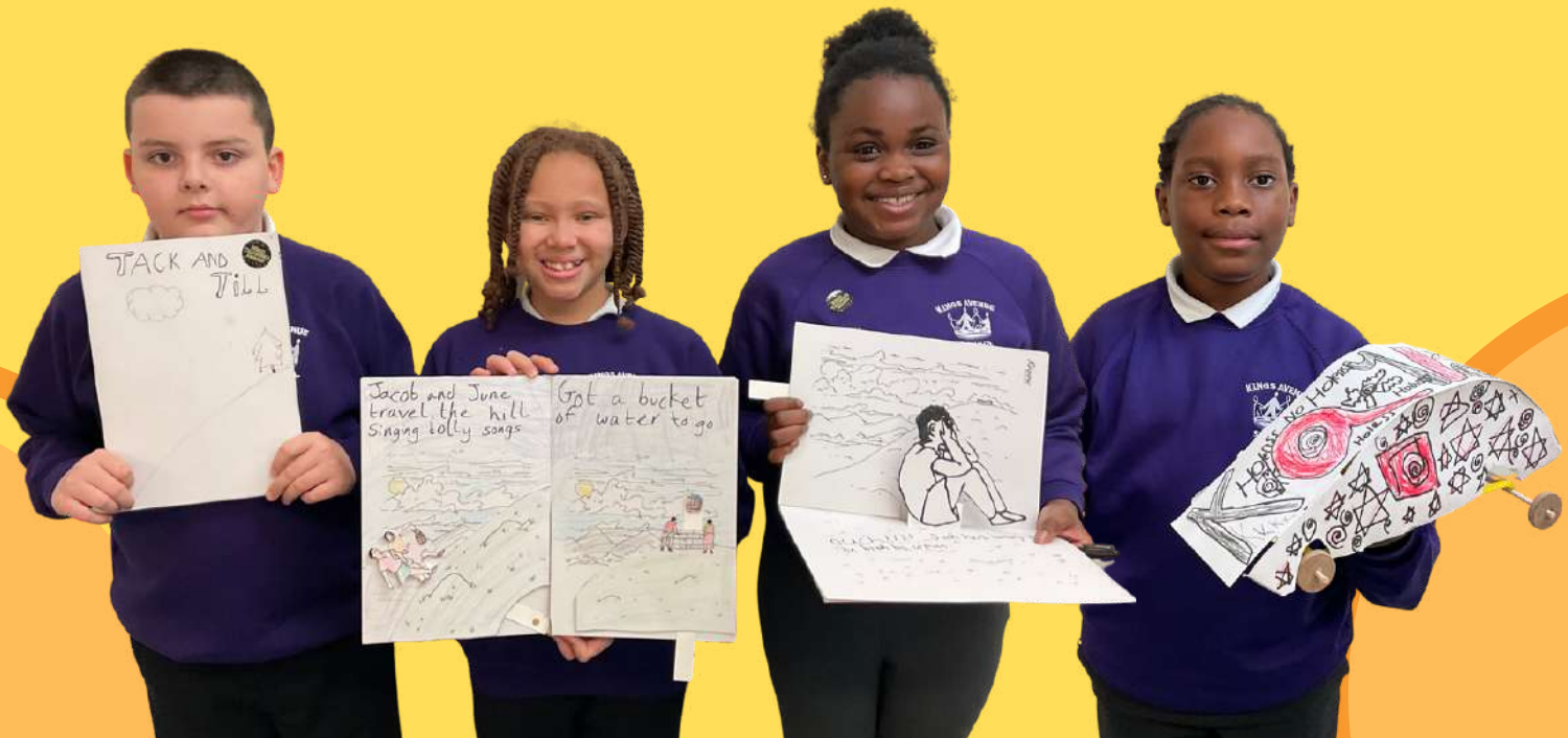
Pop-up books - Year 5

This term in DT we have been focussing on Mechanisms. The children across the school have been consolidating their making and building skills constructing a variety of creations. The EYFS and Year one made moving story books. Year two made a moving monster, not a scary one though... Year three made pneumatic toys. Year four made slingshot cars and did a great job using the glue gun. Year five transformed a nursery rhyme into a fantastic pop-up book while year 6 made automata toys.