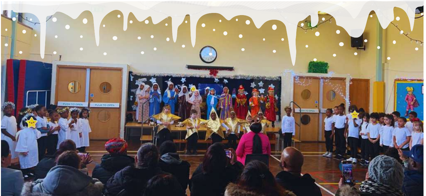
EYFS AND KEY STAGE 1

Congratulations to the entire school for delivering outstanding end-of-term festive performances! The children showcased exceptional talent, radiating energy and enthusiasm on stage. Their performances were a testament to their hard work and dedication, leaving us bursting with pride. A heartfelt thank you to all involved for contributing to these memorable moments of celebration and achievement.