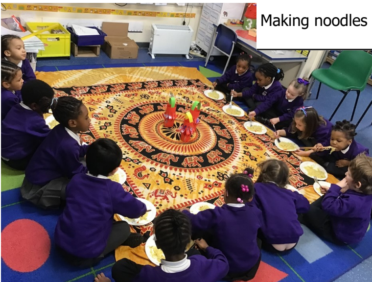
Enjoying our vegetable noodles