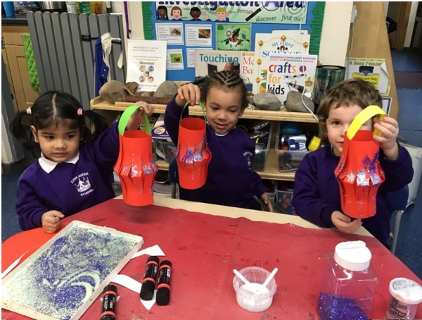
Making paper lanterns