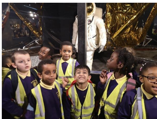
Year 1 Visit to the Science Museum

March Y5: Ragged School Museum Y1: Pizza Express Royal Festival Hall Y5: Into University