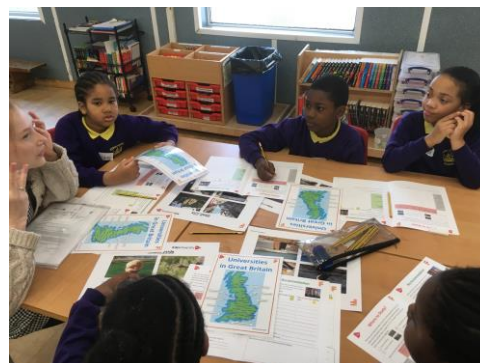
Y5 visit Into University