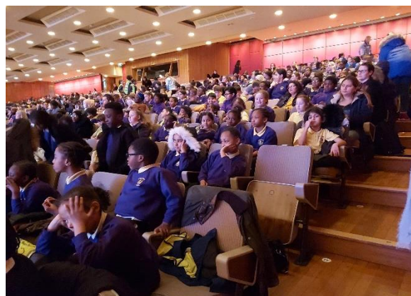
Royal Festival Hall 'London Sinfionetta' concert

And when they saw her face And heard her mad, white tune; They leaped and danced all over the place To the song of the lunatic moon.